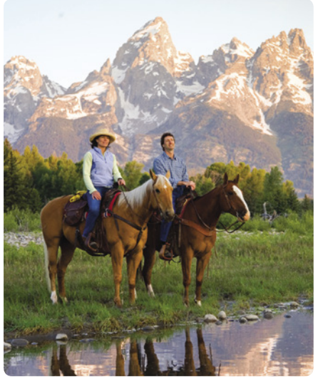
Horse riding in Grand Teton